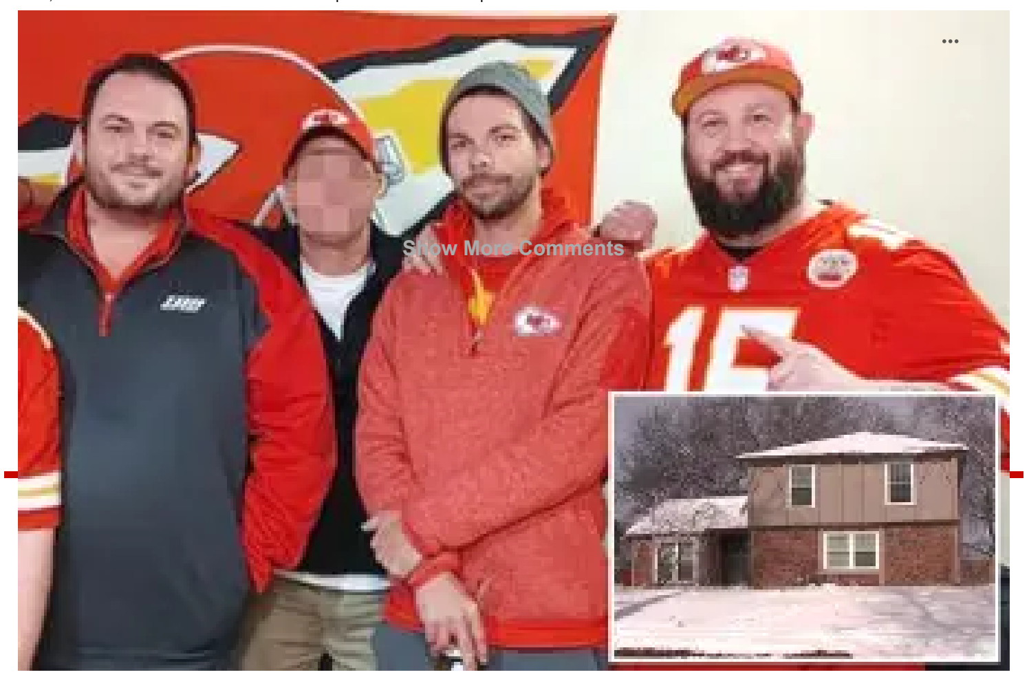
3 Kansas City Chiefs fans found days after freezing to death outside home of friend who had 'no knowledge' bodies were there: lawyer pottern So-so Next!