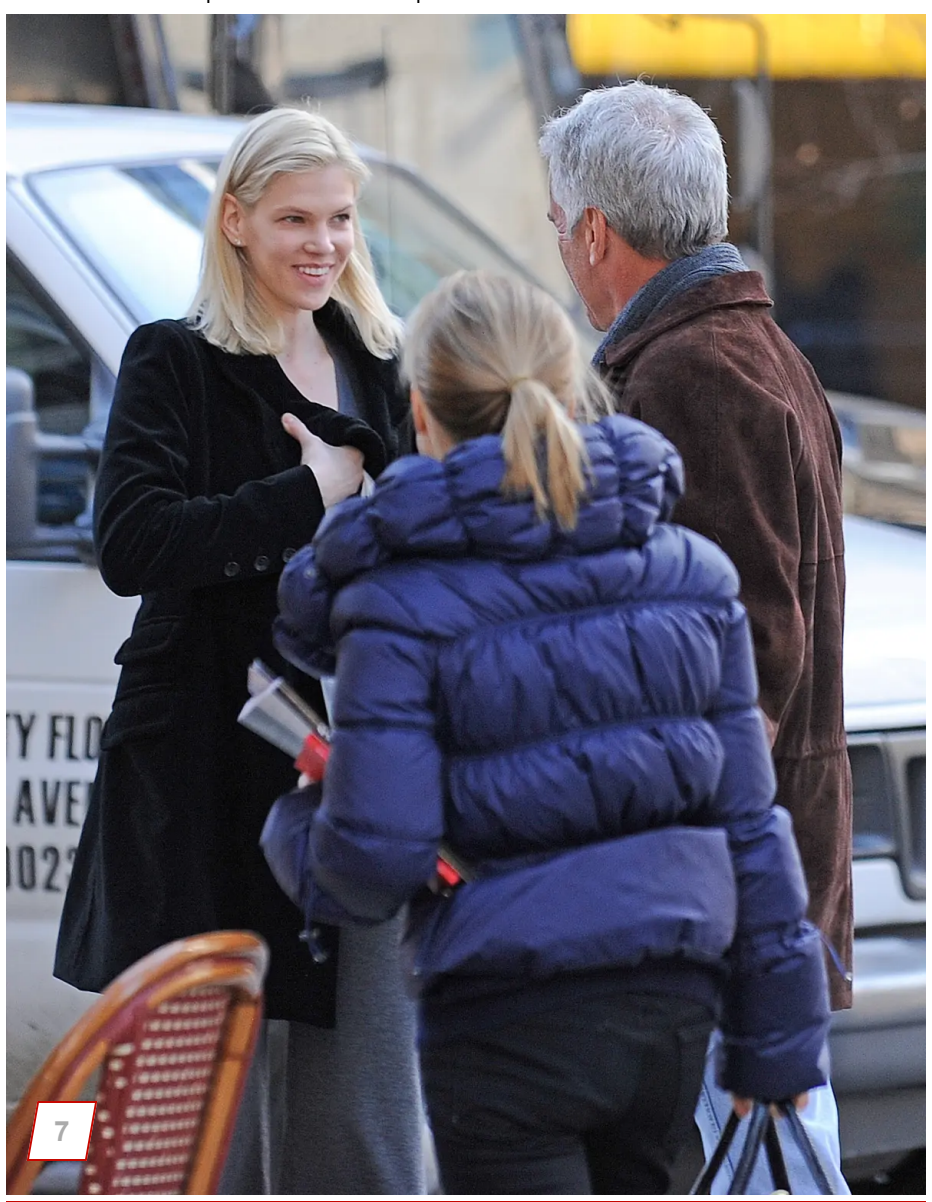
The model-turned-pilot, once known as "Global Girl," is one of the most mysterious and elusive characters in the Epstein saga.