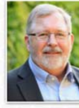
PAUL GOODWIN Cytiva