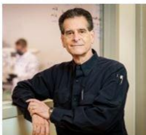
Dean Kamen DEKAR&D Corp