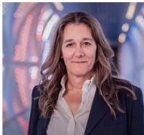
Martine Rothblatt United Therapeutics