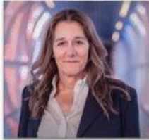
Martine Rothblatt United Therapeutics