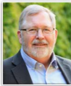
PAUL GOODWIN Cytiva