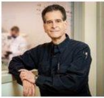
Dean Kamen DEKAR&D Corp