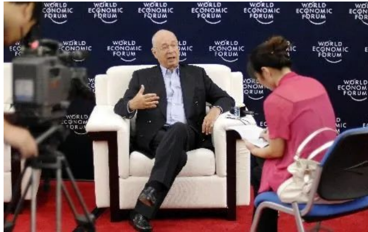
Klaus Schwab being interviewed by Xinhua News Agency

Dr. Schwab said in an interview that China has kept sustained, high-speed economic growth for the past 30 years and has become one of the fastest-growing economies in the world. He said with his hands pointing upward that China has grown from a backward economy to a leading country, that instead of fixing its eyes on the West, the WEF needs to focus more on the East in order to gain impetus from China's rapid growth. According to him, after years of development, the WEF has turned to emerging economies and growth companies, and China has become one of the new champions. He believes that China is a responsible major country that can shoulder more global responsibilities.