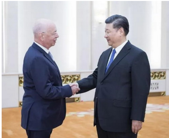
Xi Jinping meeting with WEF Executive Chairman Klaus Schwab

In the summer of 2007, the World Economic Forum (WEF) came all the way from Davos, Switzerland, where its winter annual meetings are held, to Dalian, a coastal city in China. This renowned gathering of world business leaders had its first summer session in the East of the world from September 6 to 8.