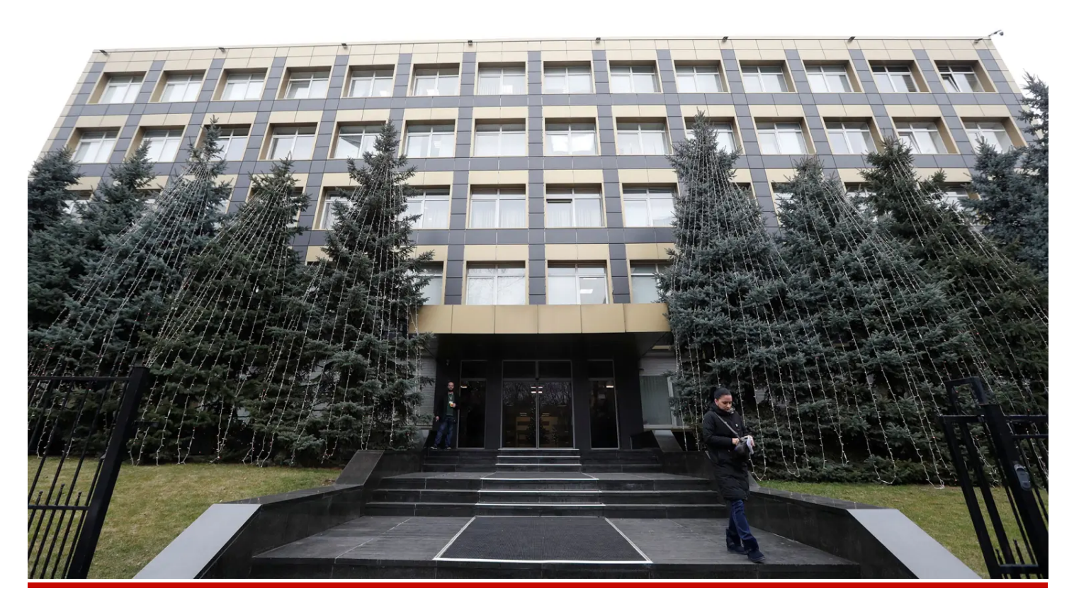
A view shows the building that houses an office of a subsidiary of the Ukrainian energy company, Burisma Holdings, in Kiev, Ukraine.

B&V had been commissioned in 2010 by the US Defense Threat Reduction Agency to build a lab in Odessa, to "enhance the government's existing surveillance systems to detect, report and respond to bioterrorism attacks, epidemics and potential pandemics," the company's website said.