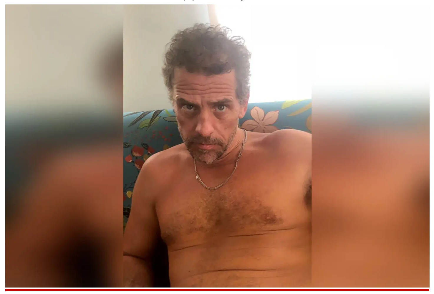
Hunter Biden funded research for the United States' military biological program, Russia's State Duma speaker Vyacheslav Volodin said.